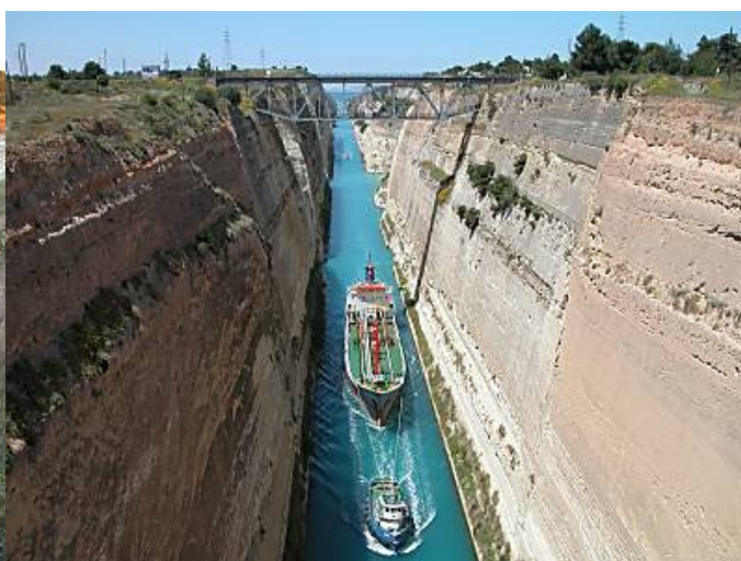
Canal built in 1800s