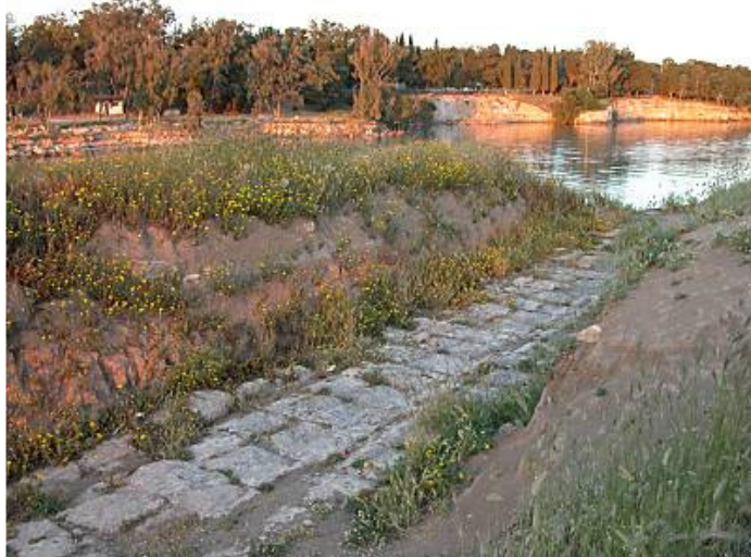
Roman road for hauling ships