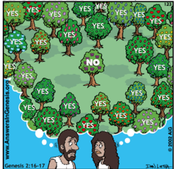
Adam & Eve think back to what they did wrong in the Garden of Eden.