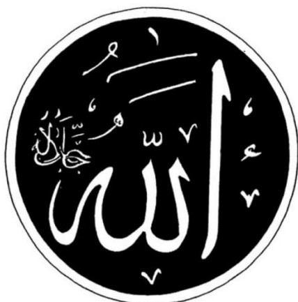
Ancient Islam Badge